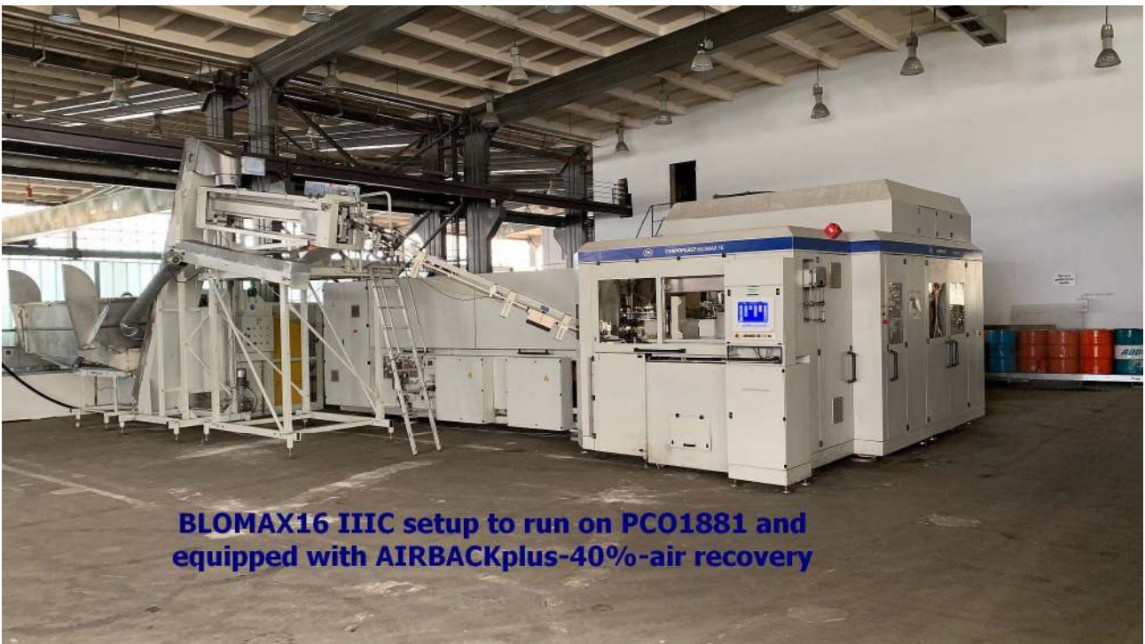
BLOMAX16 IIIC setup to run on PCO1881 and equipped with AIRBACKplus-40%-air recovery